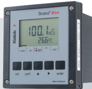
Stratos Eco 2405 Cond