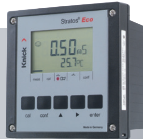
Stratos Eco 2405 CondI