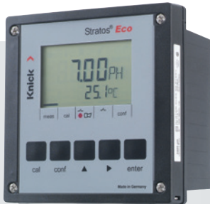
Stratos Eco 2405 pH